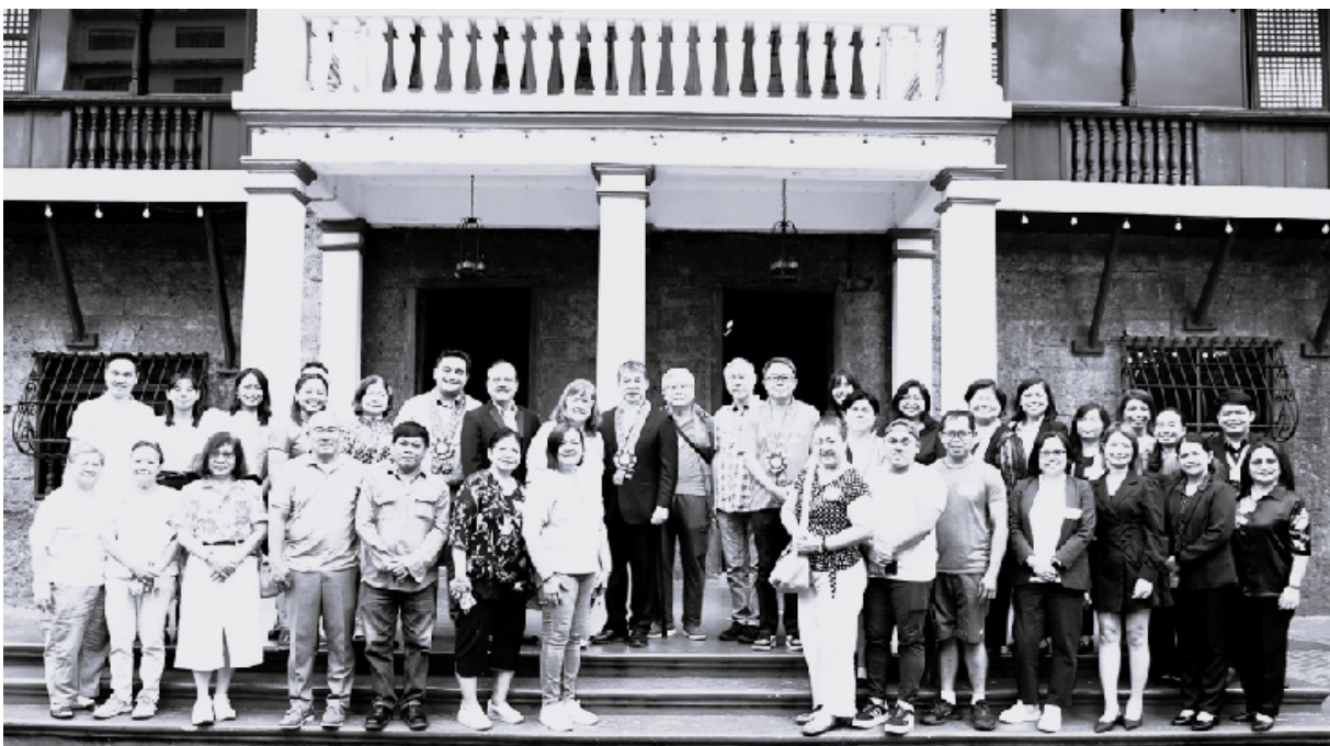
City Government of Imus